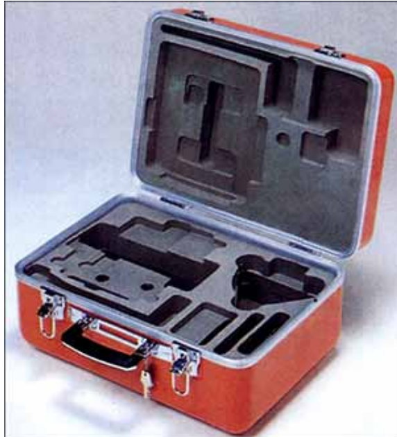
Cushion material for shock sensitive instruments eg. camera.