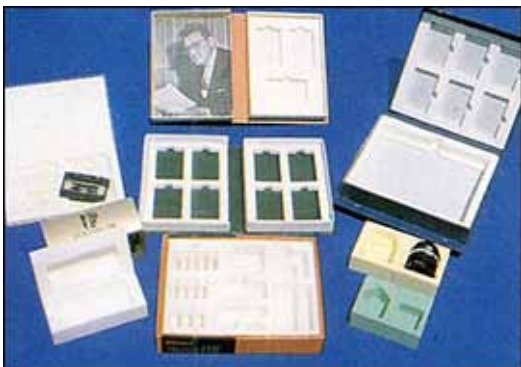
Separators for packaging cases eg. jewelry case.