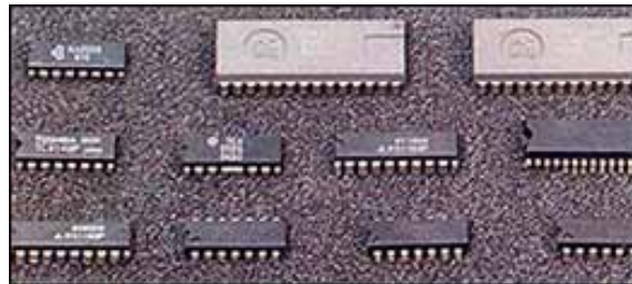
Packaging material for conductive chips. The foam can be incorporated with conductive property.